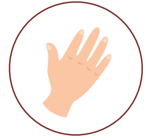
Illustration by yusufdemirci